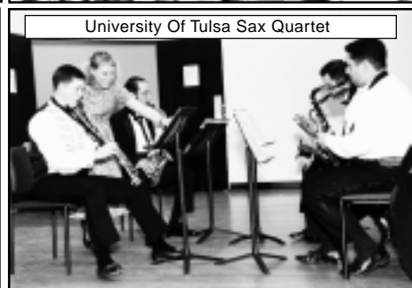
University Of Tulsa Sax Quartet

even built a certain character, I remember seeing piano players in the jazz band rip off and throw away keys that didn't play or were nowhere near in tune. They didn't stop playing to do it either. They just worked with what they had. But Giordano may have been protecting me from the smoke-filled caverns of an all-male jazz world."