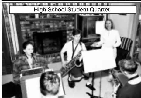
High School Student Quartet