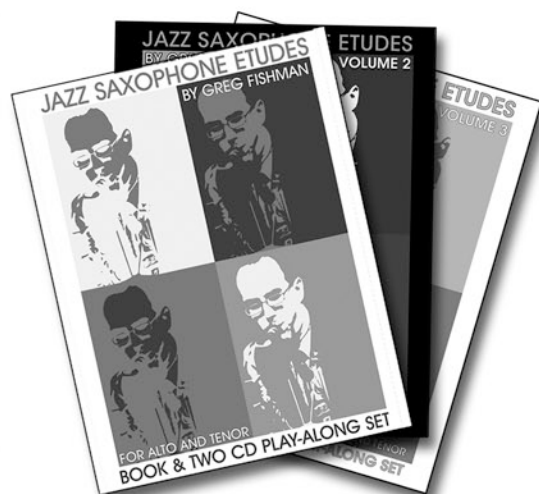
Jazz Saxophone Etudes Vol 1, 2, 3 - $19.95