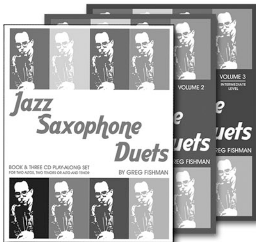
Jazz Saxophone Duets Vol 1, 2, 3 - $24.95